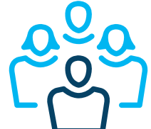
Loyalty Solutions & Merchant Cash Advance